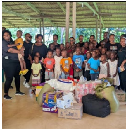
Gifts for the Children