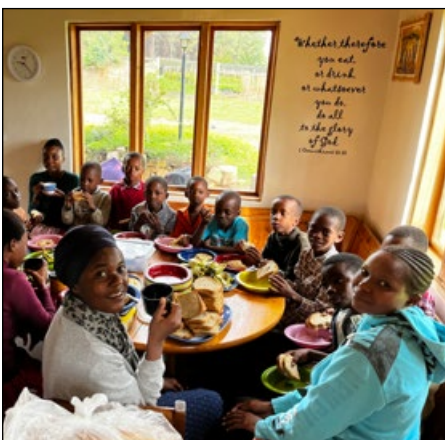
Arrival in Kibidula