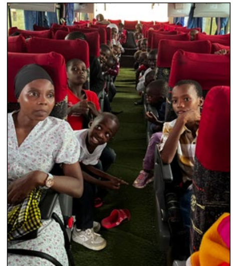
On the way to Kibidula

These experiences will remain in our children's memories for a long time. Many thanks to Kibidula for the warm welcome!