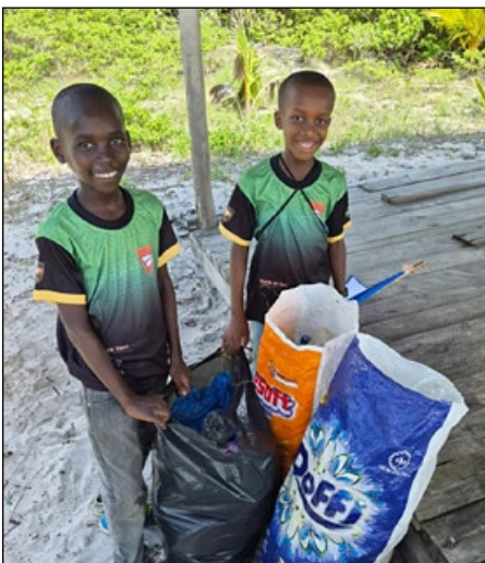
Pathfinders Trash Cleanup Campaign

Despite the rainy season, our children take advantage of every sunny day to play outside and enjoy nature. They especially enjoy playing football together.