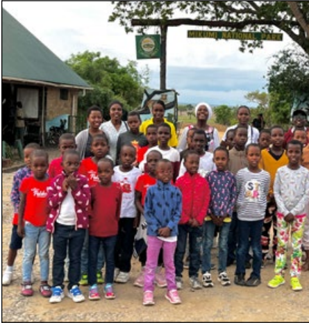
Mikumi National Park

Dunia ya Heri – African Family and Health Care e. V. • Poignring 32 • 82515 Wolfratshausen / Dunia ya Heri – African Family and Health Care • P.O Box 71573 • Dar es Salaam • Tanzania